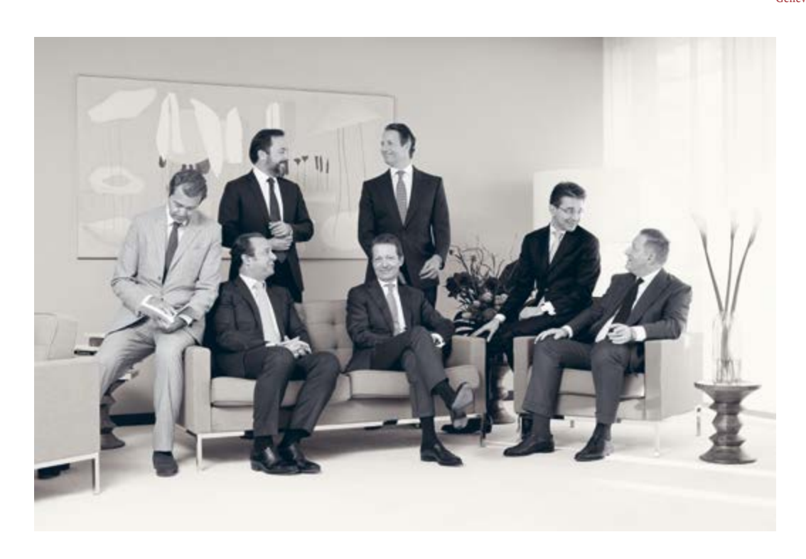
1.07 pm Route des Acacias 60 Geneva