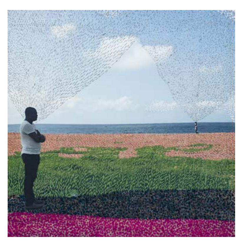
Untitled 2019. A unique print from the approximately 180 unnumbered works of the series Ça va aller (It will be okay). 24cm x 24cm, digital inkjet print on cotton canvas, hand embroidered with cotton, lurex and wool thread

'The attacks re-opened mental wounds left by the post-electoral war of 2011. Back home I felt the need to process this pain and I discovered that I could do so through embroidery. Each stitch was a way to recover, to lay down the emotions, the loneliness and the mixed feelings. As an automatic scripture, the act of adding colourful stitches on these street photographs has had a soothing effect on me, like a meditation. The embroidery was an act of channelling hope and resilience.'