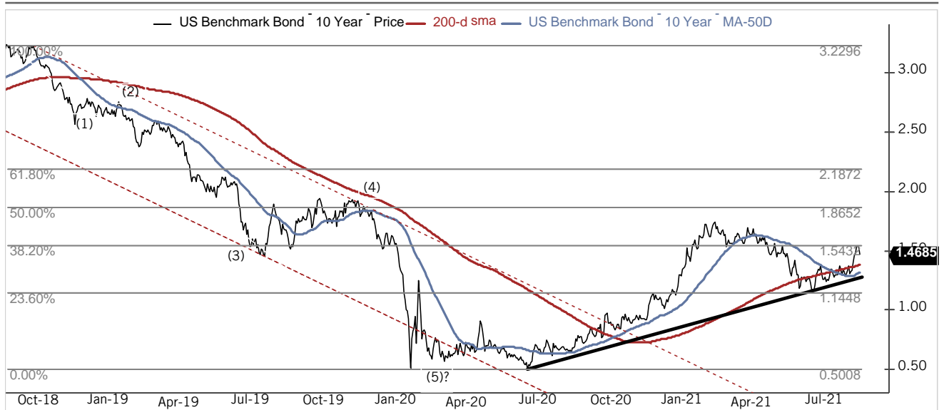
*criteria are explained in the endnotes The target price presented in the chart is based upon chart analysis. This is not the product of any Pictet financial research unit